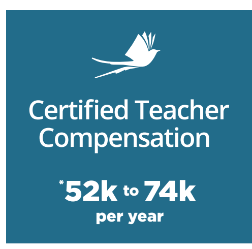
OKCPS compensation is set by OKCPS HR