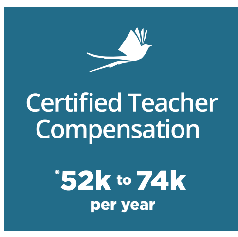
OKCPS compensation is set by OKCPS HR